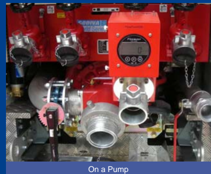
On a Pump

24 Rockdale, Mountrath Road, Portlaoise, Co. Laois, Ireland